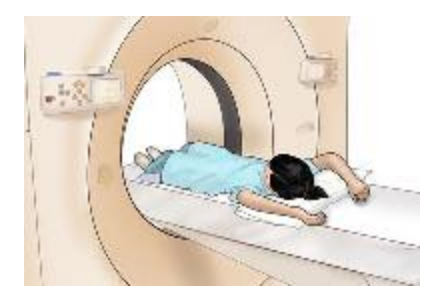
Figure 3: CT scan Procedure

MRI (magnetic resonance imaging) with gadolinium : A procedure that uses a magnet, radio waves, and a computer to make a series of detailed pictures of areas inside the body. A substance called gadolinium is injected into a vein. The gadolinium collects around the cancer cells so they