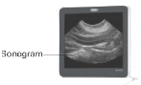
Figure 5: Sonogram Image

Ultrasound exam: A procedure in which high-energy sound waves (ultrasound) are bounced off internal tissues or organs and make echoes. The echoes form a picture of body tissues called a sonogram.