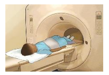
Figure 4: MRI Scan Procedure

show up brighter in the picture. This procedure is also called nuclear magnetic resonance imaging (NMRI). ENLARGE